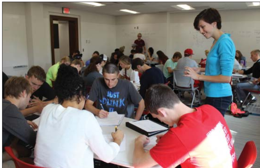
LINDSAY AUGUSTYN/UNL CSMCE

For the following fall, a new textbook was chosen that was aligned