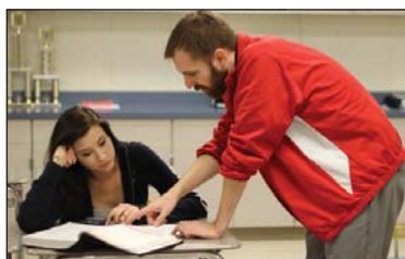
DEPARTMENT NEWS: Degree for teachers offers flexibility Page 5